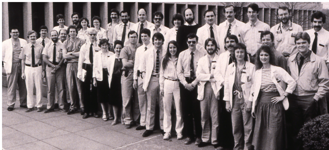
Bassett House Staff 1984-85

Here's a quiz, for some of you at least. How many in this photo of the residents from 1984-85 can you name? Unfortunately, there will be no prize – only a sense of personal satisfaction and hopefully, fond memories! And if you have any short stories to tell, send them to us for the fall issue of The Cupola! You'll find the names on page 8.